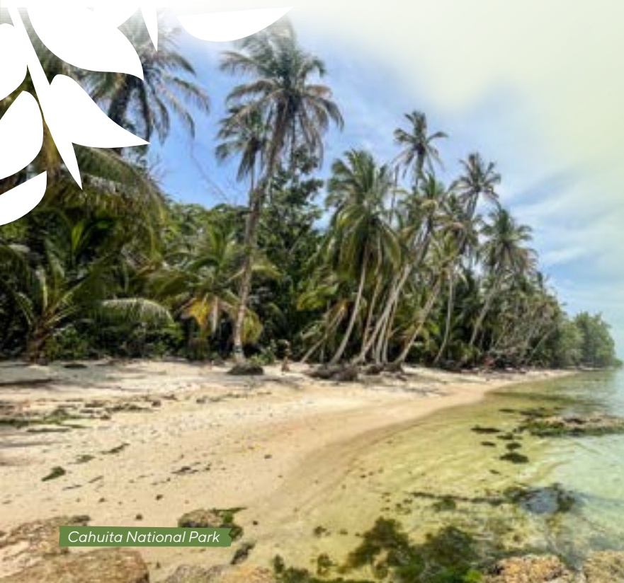
Cahuita National Park

Swim in a pristine waterfall, brave the white-water rapids, zip-line across amazing ravines, visit an ancient volcano and take a dip in the hot springs, snorkel the reefs under dazzling blue waters or simply relax on a pristine white sand beach with an Agua de Pipa (fresh coconut water).