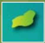
Isla del Coco