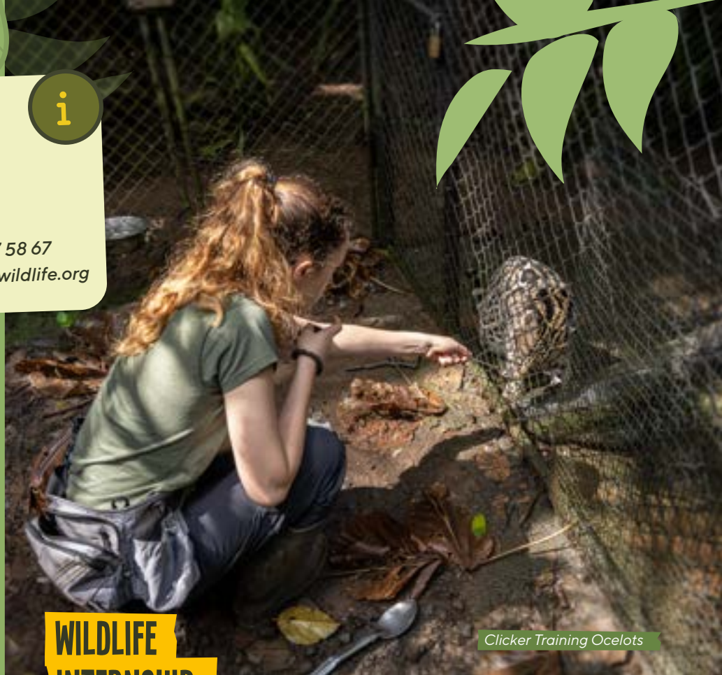
Clicker Training Ocelots